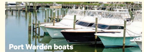
Port Warden boats

• Search Historical Records: Permits and site plans can be found in our Laserfiche files.