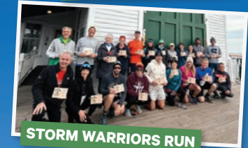
STORM WARRIORS RUN