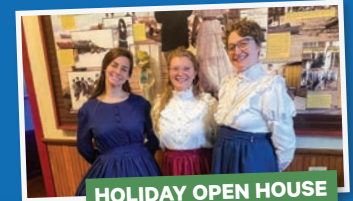
HOLIDAY OPEN HOUSE

SAT: Aquarium Feeding: Discover the wildlife that inhabits our ocean and coastal bays as you watch our aquarium animals eat their morning meal! (FREE with Paid Admission)